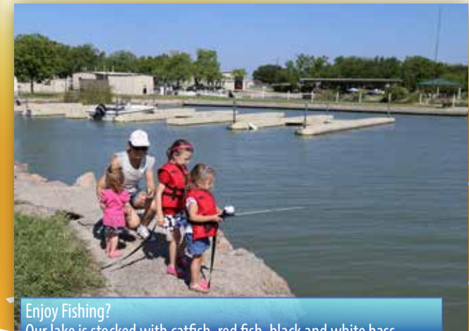
Enjoy Fishing? Our lake is stocked with catfish, red fish, black and white bass. Texas State Game & Fish licenses available at retail stores in the area