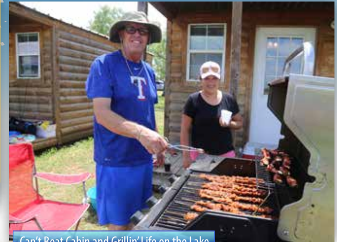
Can't Beat Cabin and Grillin' Life on the Lake